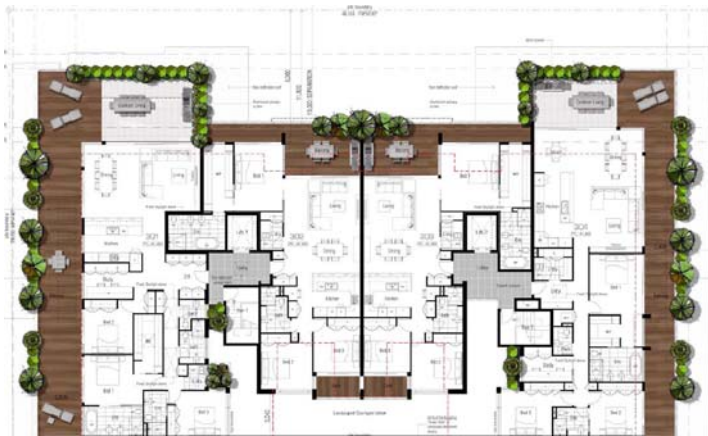
Third Floor Plan